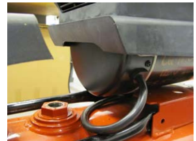
No Air Slots