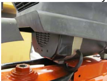
Closed Air Slots

CHECK your motor end cap for an affected motor as shown below