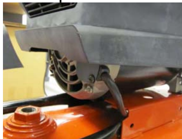
Open Air Slots